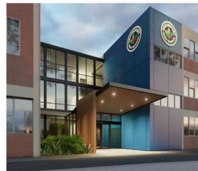
Artist's Impression of New Entrance