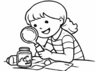
Exploring something fun

Draw a picture of someone doing really well at school.