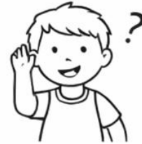
Asking a question