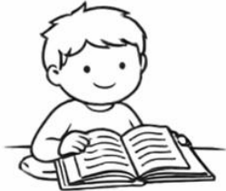
Learning something new

Look at the pictures below. Put a circle or a sticker on the pictures that show someone doing really well at school.