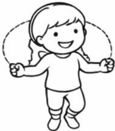
Practising a skill