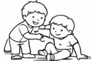
Helping a friend