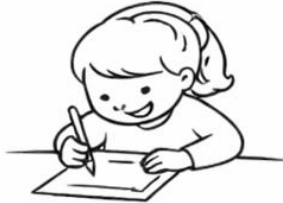
Trying something hard